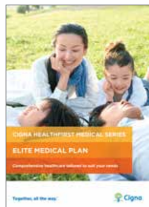
Cigna HealthFirst Elite Medical Plan offers comprehensive worldwide medical coverage with no life time limit.

Given customers' overwhelmingly positive response, Elite is well on the way to achieving huge popularity. Determined to continue tailoring customer-centric solutions for Hongkongers of all walks of life, Cigna Hong Kong looks forward to continuing to enhance its health insurance product portfolio for many years.