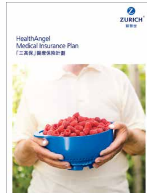
Zurich HealthAngel Medical Insurance Plan gives the insured greater peace of mind than normal health protection in filling the market gap by uniquely including the Three-Highs Conditions.

* Source: "Cardiovascular Risk Community Screening Pilot Project", 2010, Hong Kong Medical Association – Hong Kong East Community Network