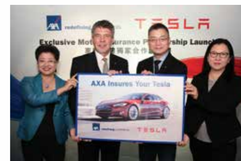
AXA General Insurance launched a customised motor insurance solution for Tesla owners in Hong Kong.

The success of InsureMyTesla is a strong testament of our commitment to responding to customers' needs.