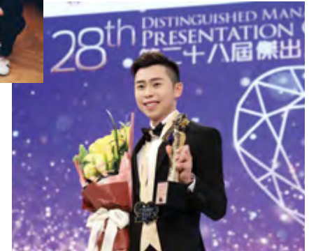
▲ More than thankful to receive honour from LUAHK, as the Distinguished Young Agent Award 2020, with also the Rookie Insurance Agent of the Year by the Asia Trusted Life Agents & Advisors Awards.